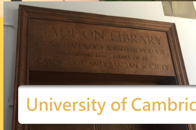
University of Cambridge Museum