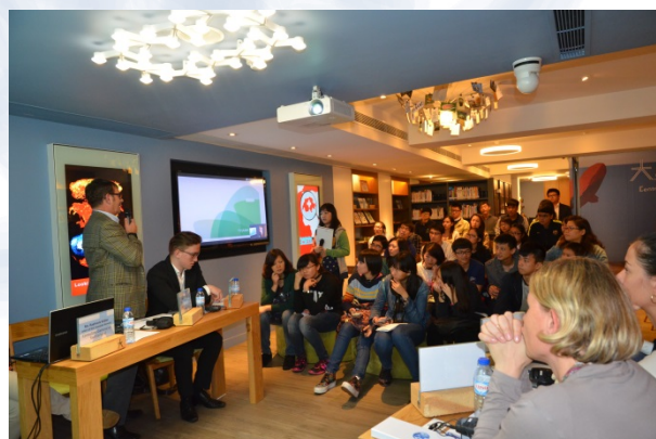
Seminar for pursuing further studies in Switzerland