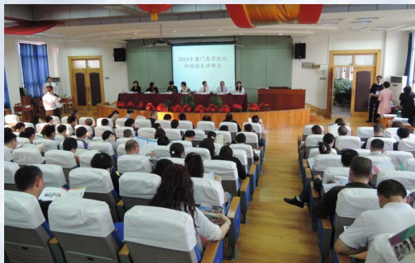
Admission Seminar at Guizhou Province