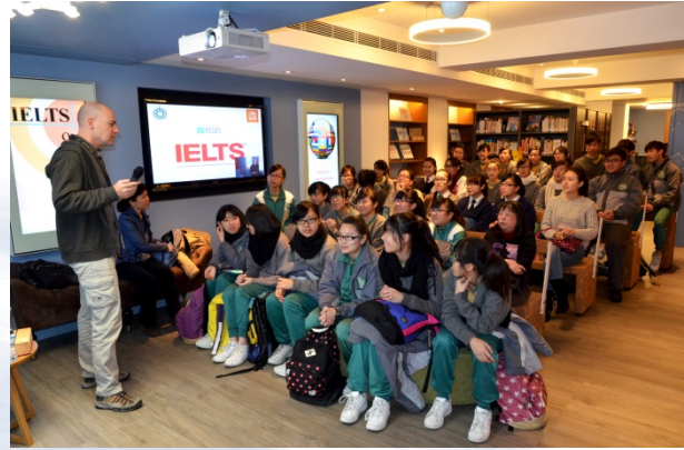
Seminar for International English Language Testing System (IELTS)