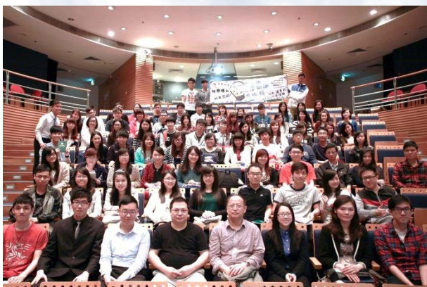
Legal knowledge contest, Faculty of Law Students' Association, University of Macau

In addition to the annual arranged projects, GAES also accepts the subsidy application of individual activities. In 2014, GAES subsidized 32 activities launched by 23 organizations and the amount of the subsidies totaled to about MOP825,000. Finally, a total of 31 activities were