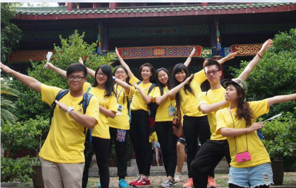
Journey to Our Origin "Jiangxi Province"