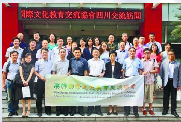
Higher Education Exploration of the Macao International Association of Culture and Education Exchange Group Photo with the Head of the Sichuan Academy of Social Sciences