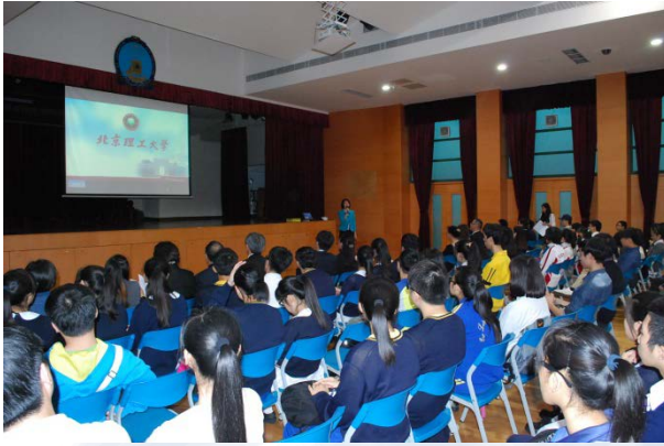
Seminar for pursuing further studies in Beijing's universities