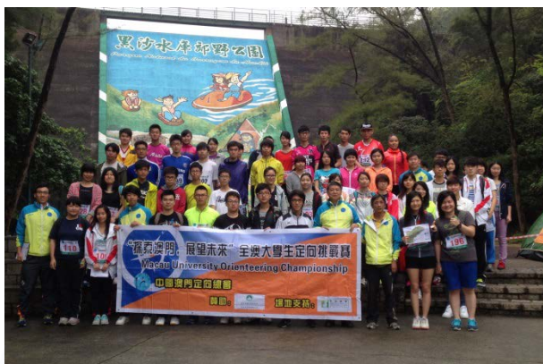
Orienteering challenge, Orienteering General Association of Macau, China

42 groups and 6 individuals; the amount of subsidies was around MOP4,100,000 and finally, 83 activities were successfully held and the actual disbursement was over MOP3,660,000.