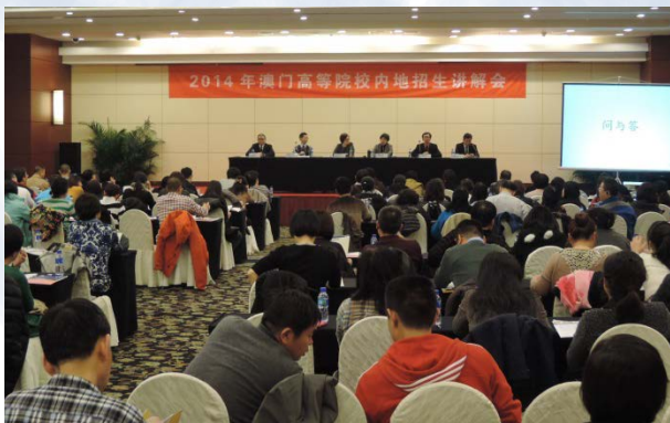
Admission Seminar at Beijing

The consented quota of the 6 Macao higher education institutions for student recruitment in Mainland China was 5,802 in academic year 2014/2015 and there was a total of 3,893 enrolled students which increased for approximately 6.3% comparing with academic year 2013/2014. Within the 3,893 enrolled students, 265 studied in the pre-university, 1,977 for the Bachelor Degrees, 1,333 for the Masters Degrees and 318 for the Doctorate Degrees.