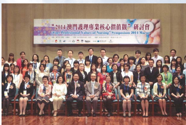
“Core Professional Values of Nursing” Symposium