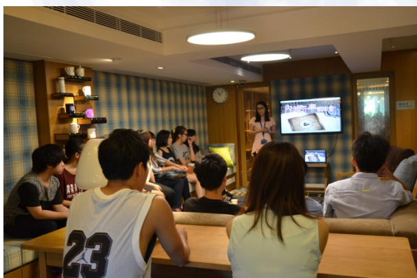
Seminar for pursuing further studies in Mainland China

In order to assist students to understand the information of education advancement in different regions so as to conductively choose and arrange for their appropriate way for further studies and career planning, GAES invites the consulate personnel from different countries, representatives of higher education institutions from all over the world and the senior students who are currently studying in the universities around the world for launching some education advancement seminars annually to introduce some essential information such as the conditions, procedures, expenses and subject advantages for further study in other places around the world, as well as sharing the university life and explaining the precautions. In 2014, there were many relevant activities such as the seminar series on further studies outside Macao and public examinations, alumni sharing sessions, students by recommendation pre-examination counseling seminar, and further studies counseling seminars launched in all secondary schools of Macao etc, relevant information can be referred in appendix 1.