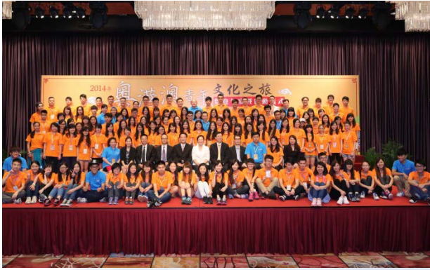
Cultural Tour of Youth from Guangdong, Hong Kong & Macao