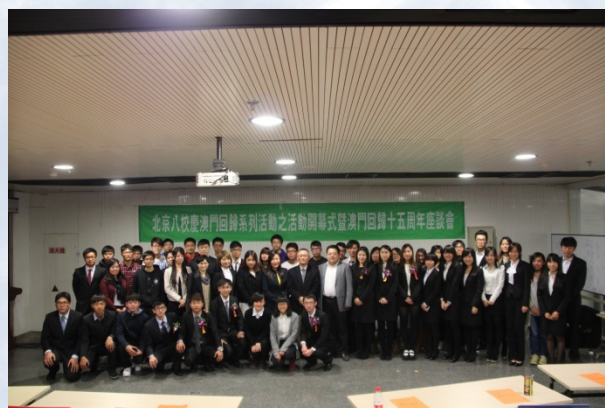
Celebration of 15th anniversary of Macao handover, Peking University - Macao Cultural Communication Association