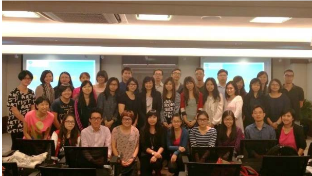
Student Crisis Management Training Workshop

Furthermore, to strengthen their knowledge of the mental health problems or crisis, as well as enhance their assessment ability on relative problems and the various strategical techniques for handling and intervening, the “Crisis Management in Practice Workshop” was launched in November and there were a total of 17 student counselors, social workers and relative support personnel from 6 Macao higher education institutions.