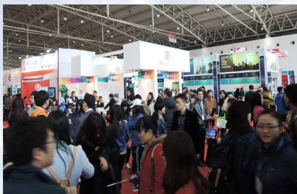
19 th China International Education Exhibition Tour

GAES organized 5 Macao higher education institutions (University of Macao, Macao Polytechnic Institute, Institute for Tourism Studies, Macao University of Science and Technology and City University of Macao) to join the “China International Education Exhibition Tour 2014” launched in Beijing in March so as to introduce the situation of the Macao higher education to the students of Mainland China for them to obtain the student recruitment information of the Macao higher education institutions.