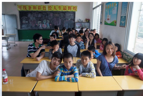
Social caring activity, Association of Macao College Student in Fujian Province