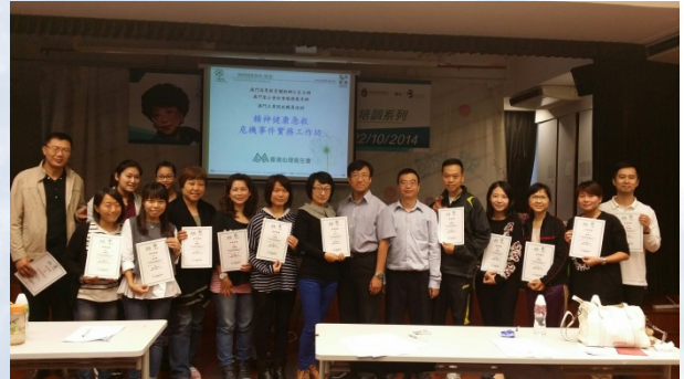
Crisis Management in Practice Workshop