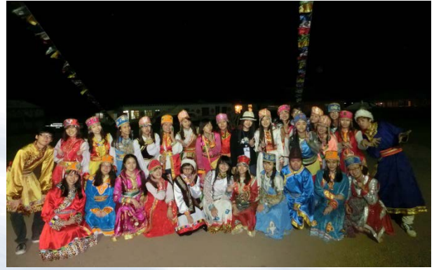
Depart from "Gansu Province"