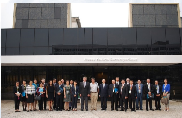
Group photo with professors and officials of University of São Paulo

Through this delegation, Brazil and Macao deemed that their exchange and cooperation can be strengthened in the future so as to advance the mutual development on higher education among the two regions.