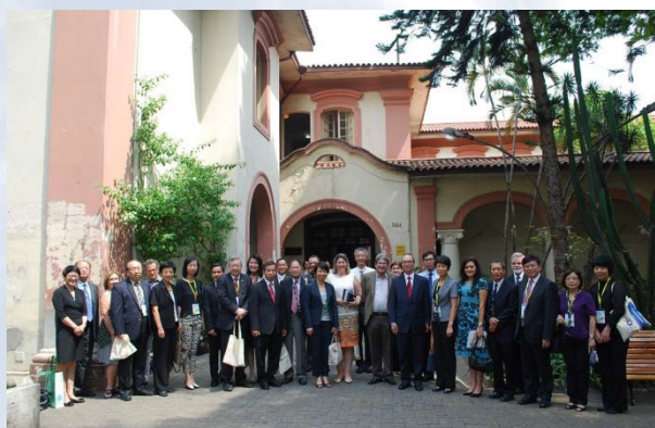
Group photo with professors and officials of Pontifical Catholic University of São Paulo