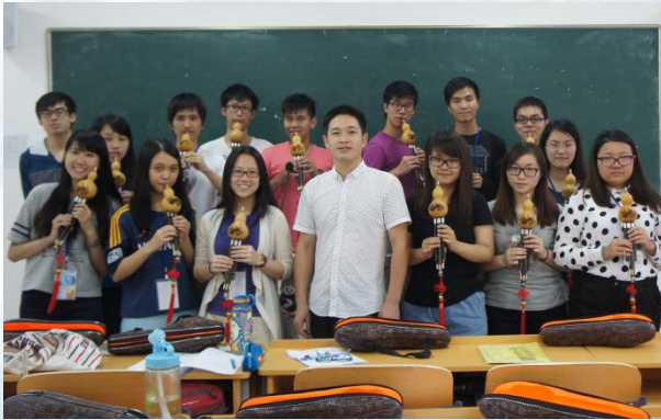
Learn Putonghua in Fujian