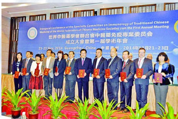
Inaugural Conference of the Specialty Committee on Immunology of Traditional Chinese Medicine of the World Federation of Chinese Medicine Societies cum the First Annual Meeting