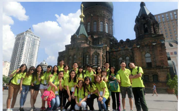
Explore Our Motherland – "Harbin"