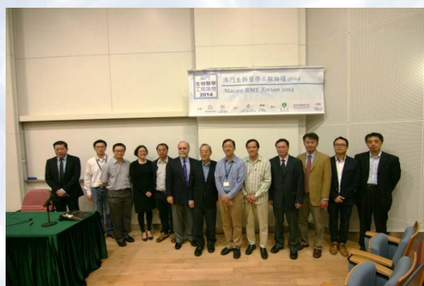
Macao Biomedical Engineering Forum