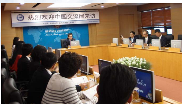
Visit to Hanyang University, Korea

Furthermore, GAES also organized 6 Macao higher education institutions (University of Macao, Macao Polytechnic Institute, Institute for Tourism Studies, Macao University of Science and Technology, University of Saint Joseph and City