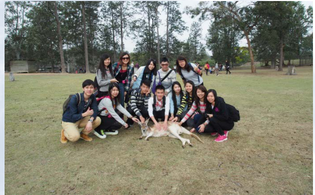
English Cultural Tour to Australia