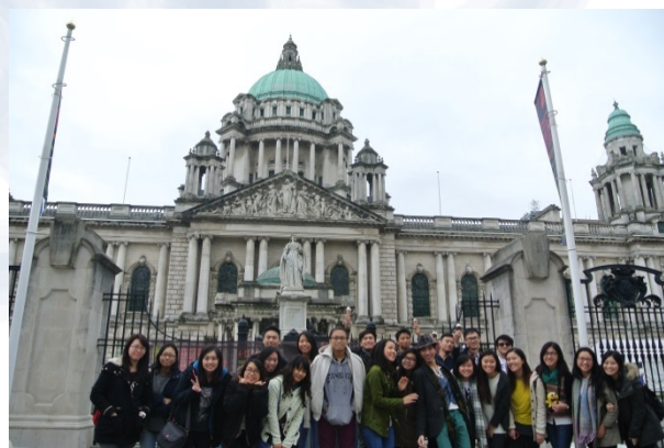
Field trip to Northern Ireland, Macao Youth League of the United Kingdom